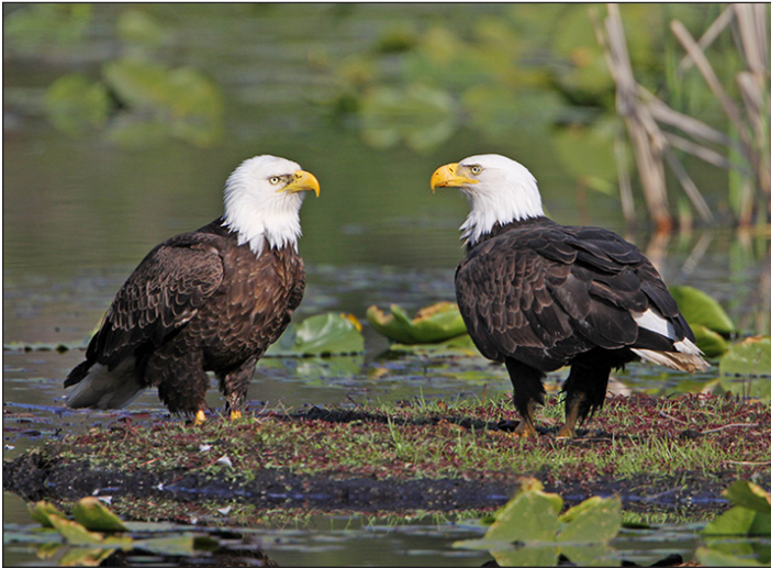
Bald Eagles