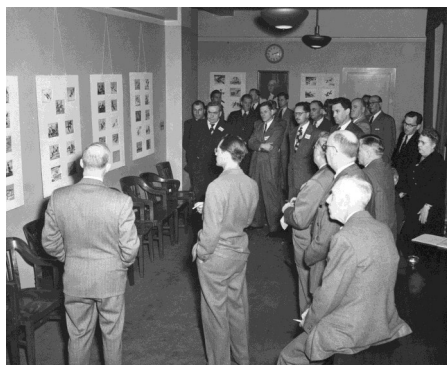
The annual Duck Stamp art contest is an American tradition. This photo shows the 1951 contest.

The Junior Duck Stamp art contest and education programs reach thousands of children annually.