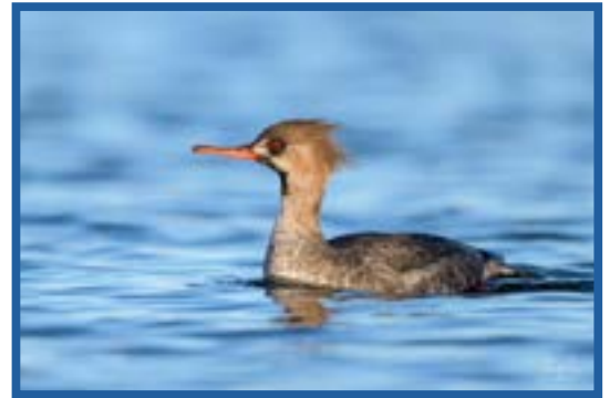
Red-breasted Merganser-Female