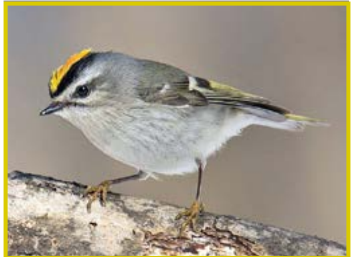
Golden-crowned Kinglet

Their conservation status seems to be stable and they actually appear to be expanding their range into more southern conifer stands in the midwest and the Appalachians. If you would like to know more about the Golden-crowned Kinglets, you can read Winter World by Bernd Heinrich.