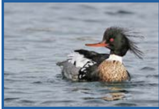
Red-breasted Merganser-Male

Swamp Sparrow: Heyburn SP (11/23-JI); Wolf Lodge Bay (11/29-TL)