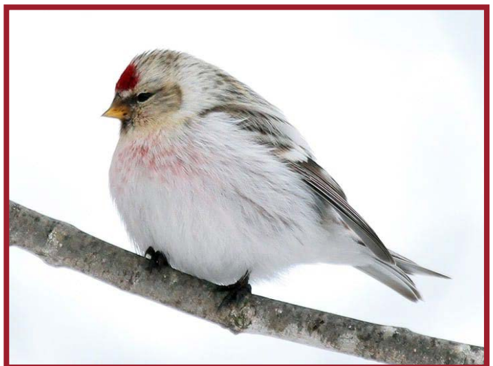
Hoary Redpoll