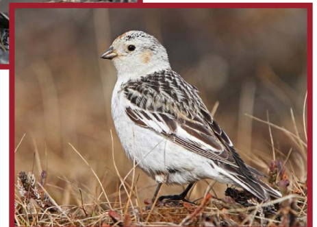
Snow Buntings Male - Female