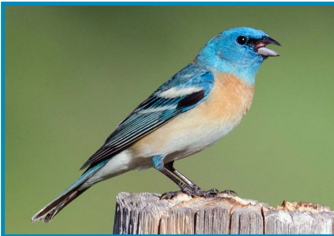
Lazuli Bunting

"I've had newcomers join me on field trips who didn't wear hats or use sunscreen in the summer, or have warm jackets and boots in the winter," she recalls. "They never came again, because if you're not comfortable to be outdoors for hours, it isn't much fun."